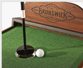
Cup with Interactive PushNPutt® Flagstick