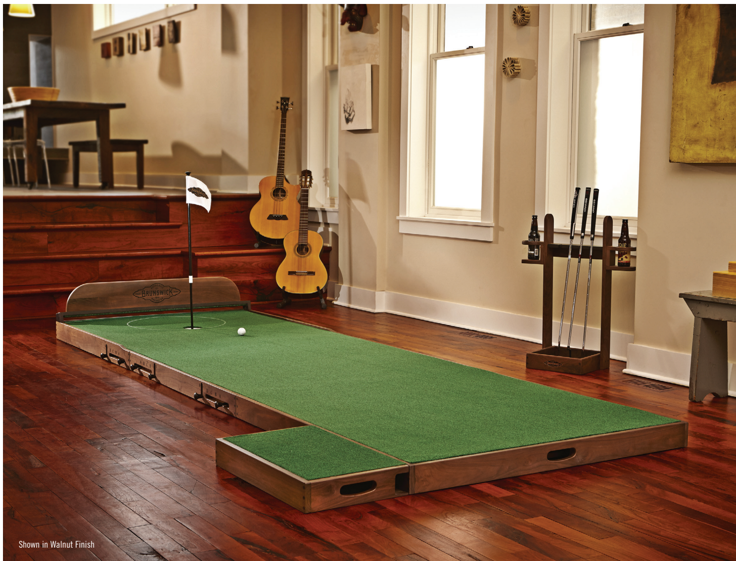
Shown in Walnut Finish

When you want the most realistic course-like challenges but don't have room for a 20-foot length of a green, The MacDonald is the ideal option. The MacDonald is a special tribute to CB MacDonald, one of the great amateur golfers of all time and the architect of the famed National Golf Links. This green comes complete with 6 break stations for up to 50,000 different break combinations, and it has the ability to be elevated on both ends, so you can replicate those uphill and downhill putts that most impact your game. The MacDonald is the ultimate putting green for professional and amateur golfers who want to kick their game up a few notches.