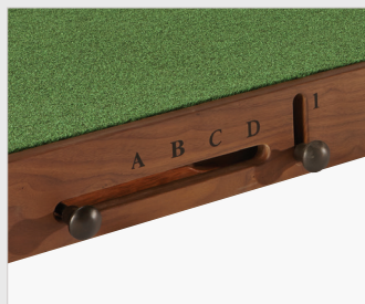
Six Break Stations